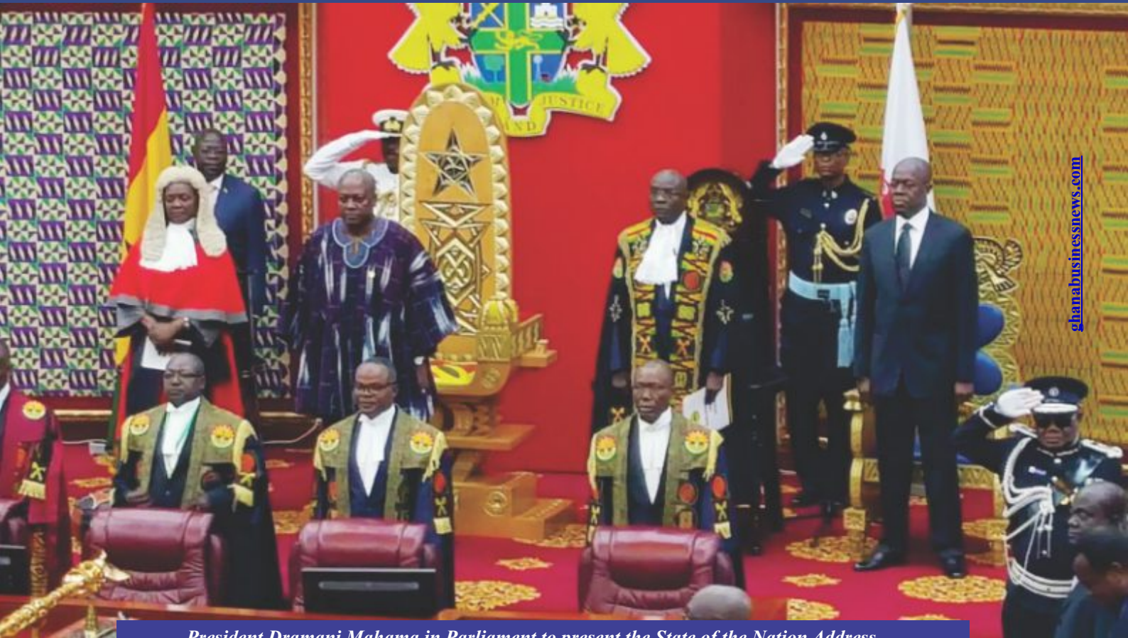
President Dramani Mahama in Parliament to present the State of the Nation Address

For the many anti-corruption crusaders in the country, this year's State of the Nation Address which touched on the fight against corruption evoked more questions than the speech provided answer to. The question that many people asked was that, is this not yet another traditional tribute to a dead course or a glorious ritual to win some floating votes?