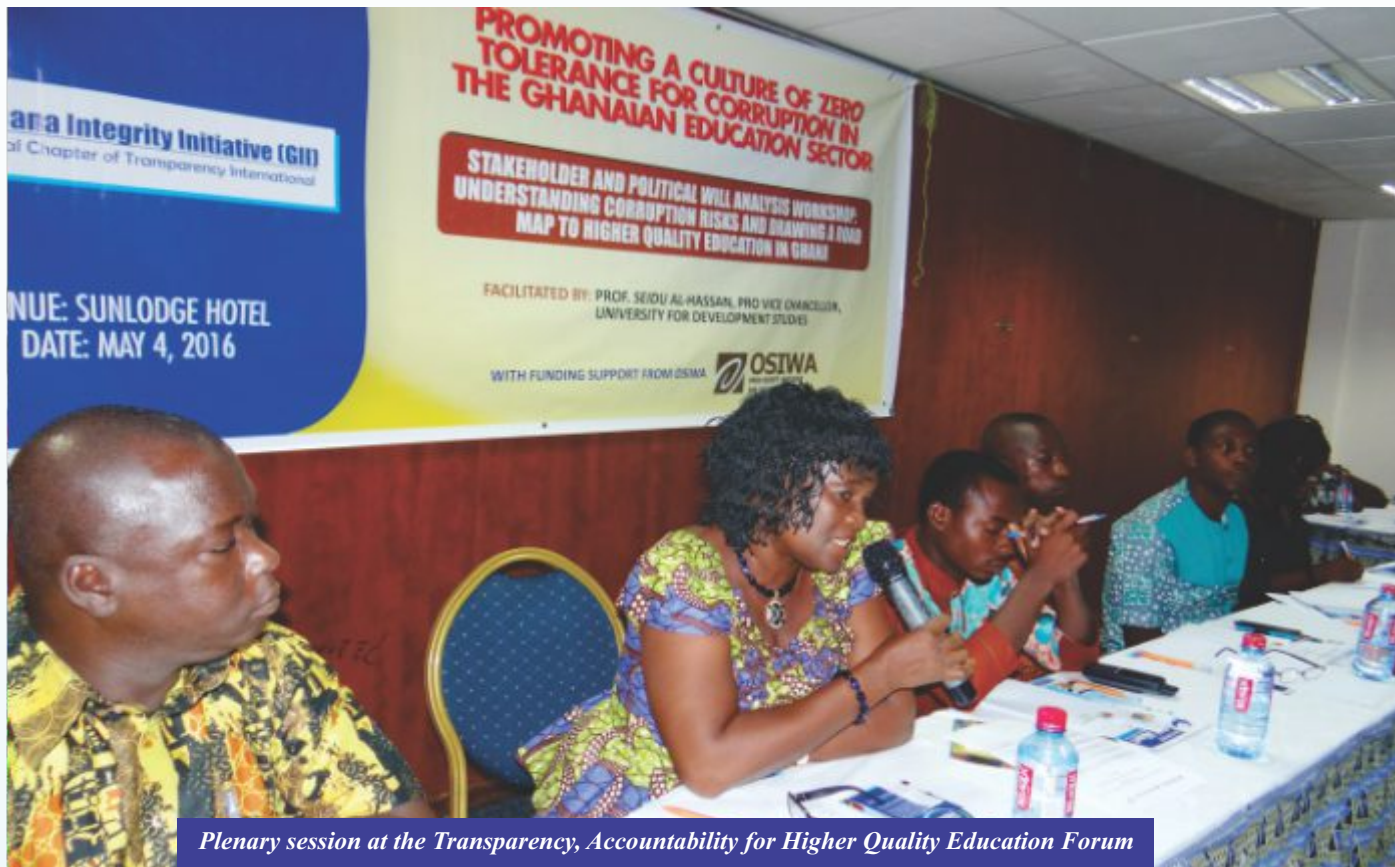
Plenary session at the Transparency, Accountability for Higher Quality Education Forum

In today's competitive world education has become a basic necessity for man just like food, clothing, and shelter. Education promotes good habits, values and creates awareness of the effects of corruption and other social vices on our daily lives. The relevance of education is even evident from today's technological world. Education is the only fundamental way by which a desired change and development in our society can be realized.