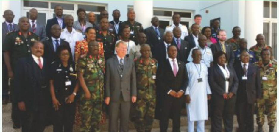
TI UK and some members of the Military Command of Ghana Armed Force

He said Ghana has had a long and mutually beneficial relationship with GII