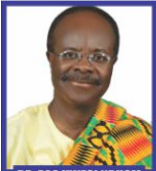
DR. PAA KWESI NDUOM

March, April, May 2016 - Issue Number 45 - ISSN:0855 - 742X