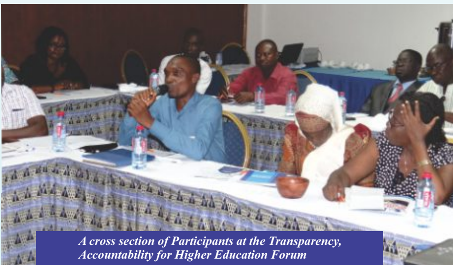
A cross section of Participants at the Transparency, Accountability for Higher Education Forum

The workshop was very fruitful and interactive as it adopted a participants centered approach to learning. Group discussions were mainly to keep