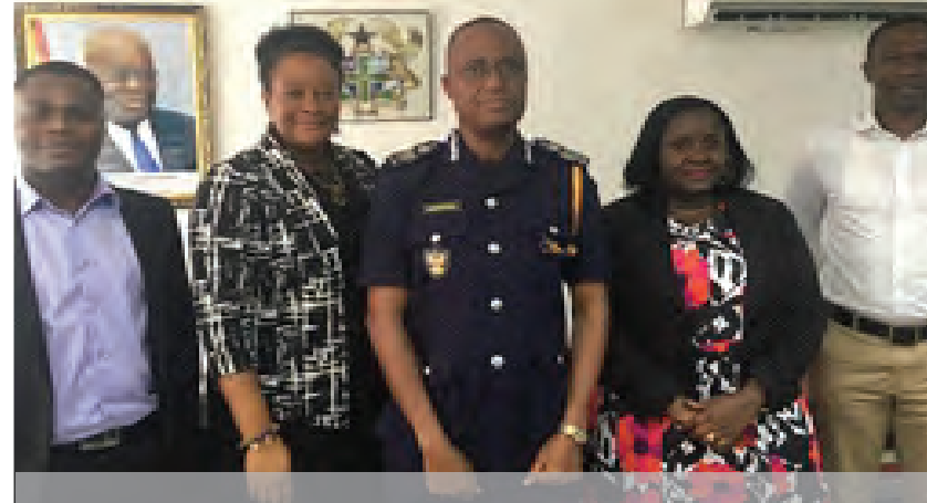
GII Consortium with officials of the Customs Division of GRA

His reaction came after a research report entitled: "Corruption is Eating Us Up: A Call to Action" was launched by the GII consortium mentioned the Passport Office as one of the institutions where citizens reported that they experienced bribery.