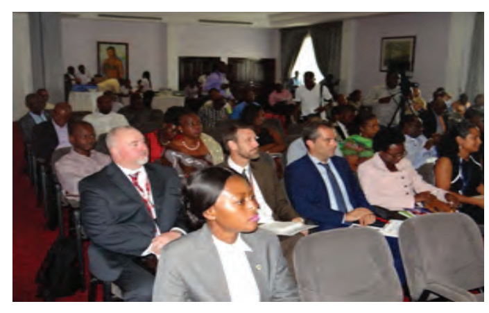
Cross section of participants at the ADISS Launch

Through the use of the participatory monitoring and evaluation approaches, citizens are being empowered with the skills and knowledge to articulate their views on corruption-related issues, specifically providing feedback on the impact of corruption on their lives, which has led to the election of Anti-Corruption Champions in the 50 districts where the project is being implemented. The approach has led to the reorientation and alignment of existing citizens groups working with the participating members of the GII Consortium and CSOs for a well- coordinated advocacy to reduce corruption incidence in Ghana.