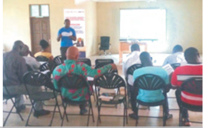
Anti-corruption Champion Taking the Management of the District through the AG's Report Concerning the Nkoranza North District Assembly