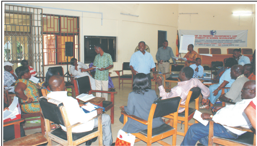
Participants during a group discussion at promoting transparency and accountability in School Management at Ga West.