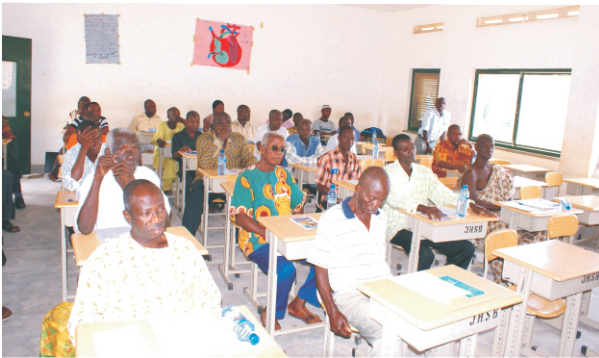
Participants at the workshop to promote Transparency and Accountability in school management at Assin-South, Central Region.