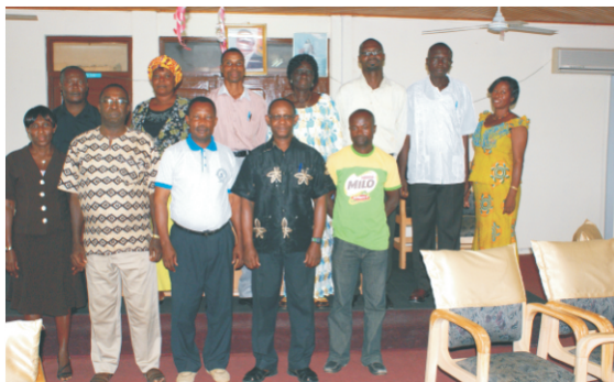
Newly inducted executive members of the Twifo-Praso branch of the SAC in a group picture.