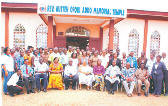
A group picture of participants of the Social Auditing Club (SAC) at Somyanya.