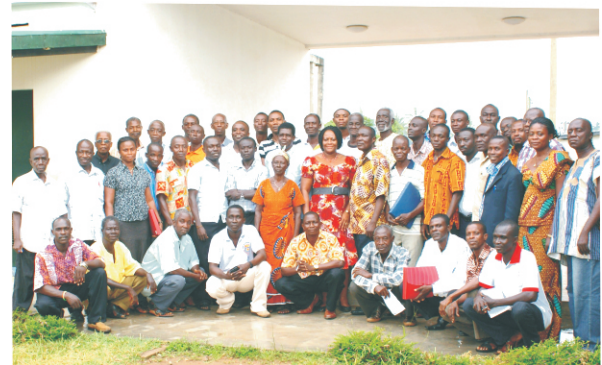
A group picture of participants during the workshop for promoting Transparency and Accountability in schools at Assin-South.