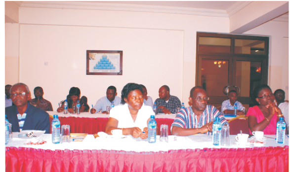
A cross-section of participants at the launch of the Ghana National Water Supply Integrity Study.