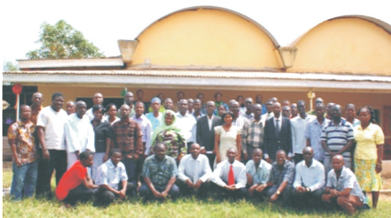
A group picture of participants at an ALAC Outreach programme in Nkawkaw.