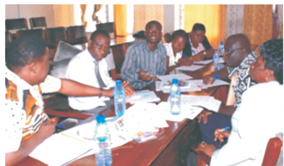
A group discussion by participants at an ALAC Outreach Programme in Koforidua.