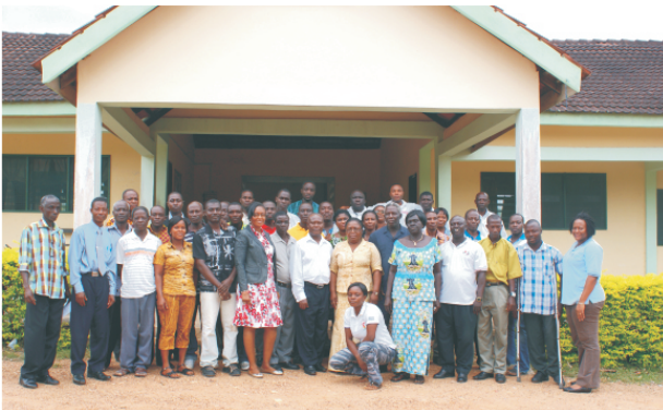
A group picture of participants of the SAC at Shama in the Central Region.