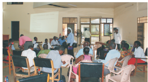
Participants during a group discussion on formulating their M & E budgets at Ga-West.