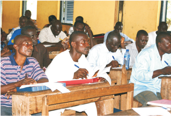
Participants at a workshop at Ahafo-Ano South, in the Ashanti Region on promoting Transparency and Accountability in schools.