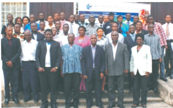
A group picture of participants with the MCE of New Juaben, Hon. Alex Asamoah (in smock) at an ALAC Outreach programme.