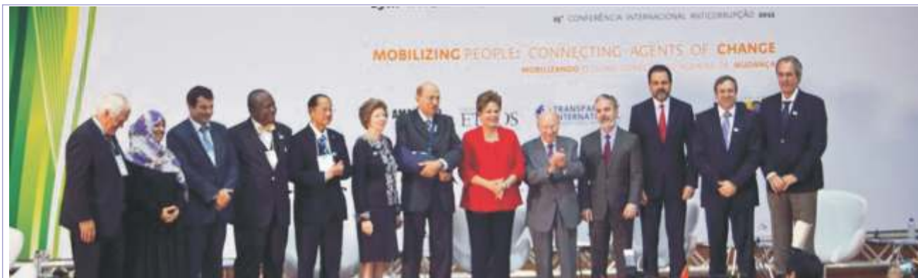
A group picture of participants at the 15th International Anti-Corruption Conference (IACC) held in Brasilia in November 2012

Activists, businesspeople, politicians, public officials,