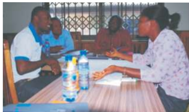
A group session during the Takoradi Risk Mapping and PV editing training under the LEARN Project.