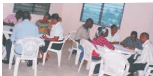
Participants during the risk analysis group session of the LEARN Project