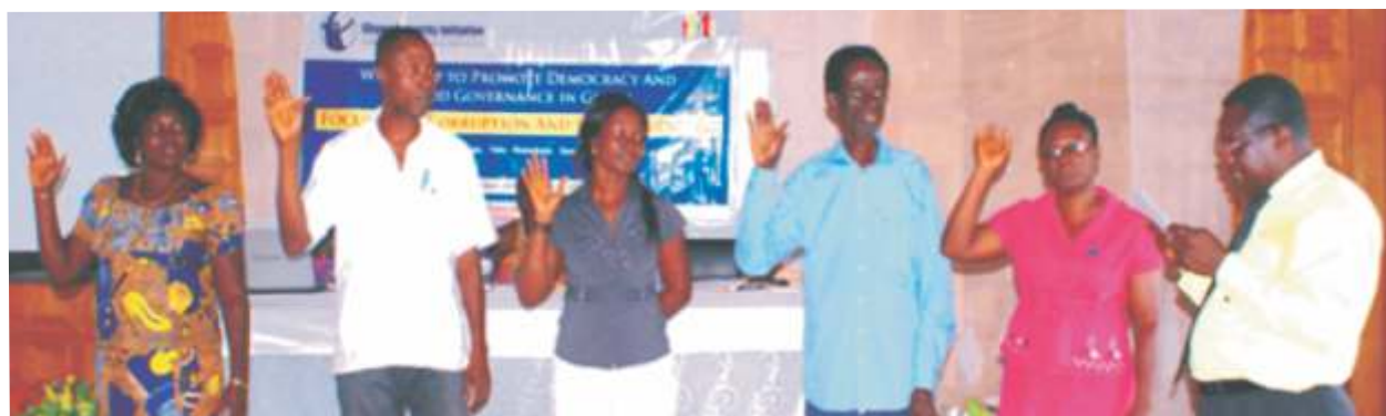
Executive members of SAC at Agona-Nkwanta being sworn in.