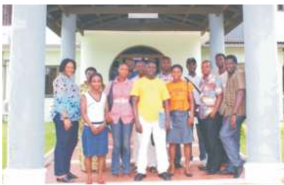
A group photograph of participants at the LEARN Project, Risk Mapping and PV editing training in Takoradi.