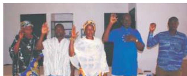
Executive members of SAC at Savelugu Nanton being sworn in.