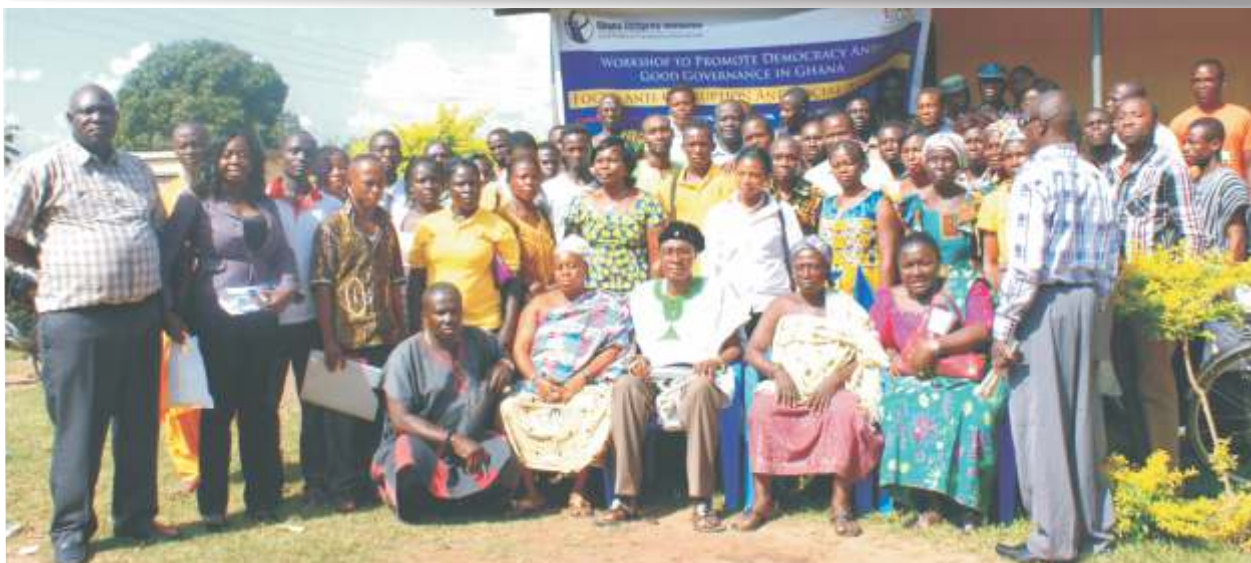
A group picture of participants at Tain-Nsawkaw workshop in the Brong-Ahafo region.