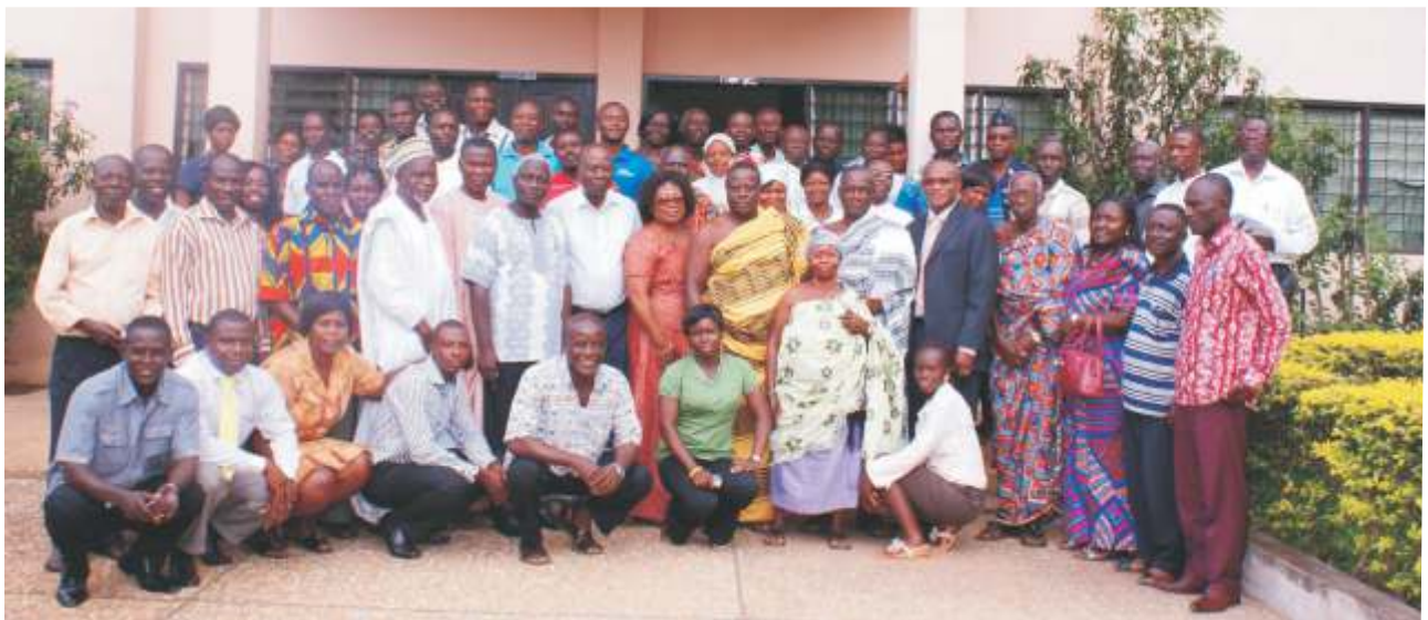
A group photograph of participants after the formation of a Social Auditing Club at Konongo.

After the nominations, the executive members were sworn into office by the Regional Directors of NCCE present. The executive members are expected to start working on the projects in their various districts this year due to the upcoming election. GII believes the successes chalked in the other eight districts will be emulated in these new districts.