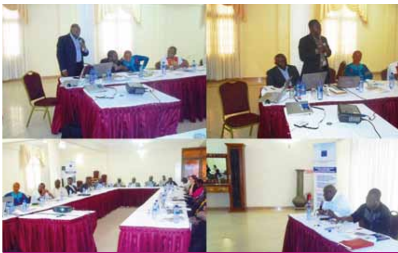
Corruption Risk Assessment Inception Meeting

Given this, it is clear that illegal and corrupt actions in the forestry sector must be seen as a problem of forest management, and clear indication of governance weaknesses. Likewise, they cannot be divorced from the broader context of law enforcement or integrity of public officials (Callister, 1999). Corruption — paying of bribes, political patronage and so on — operates either to allow many of these activities to occur in the first place, or to allow them to proceed unchecked or unpunished (Callister, 1999).