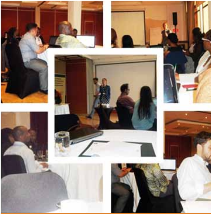
TI REDD+ International Conference in Kenya