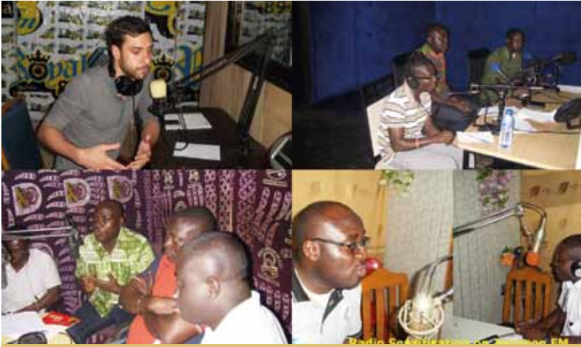
Field Visit by Transparency International REDD+ Coordinator