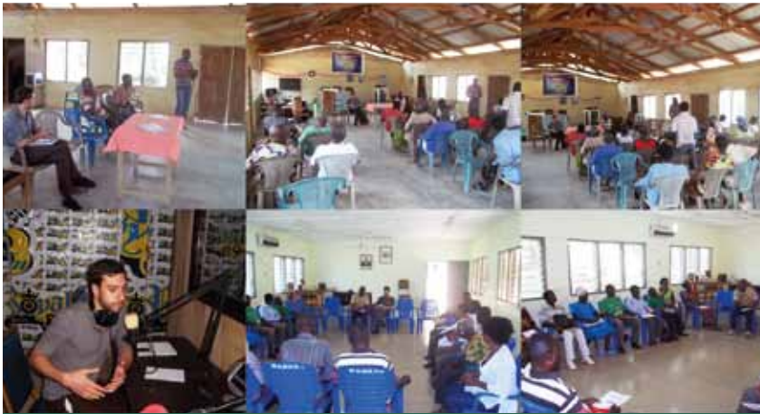
Field Visit by Transparency International REDD+ Coordinator