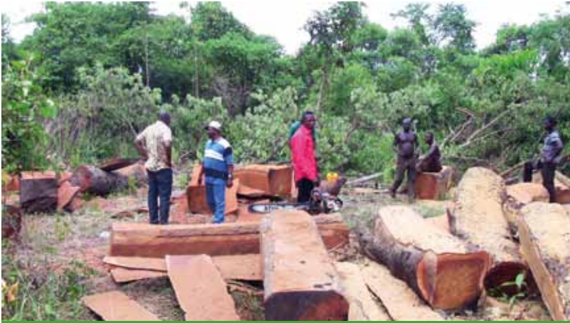
Illegal Chainsaw operators caught in the act