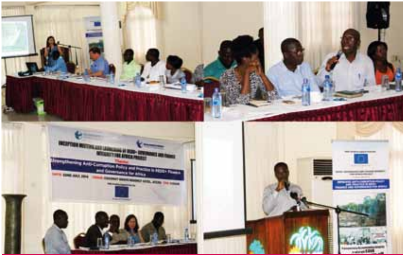
REDD+ Project Launching