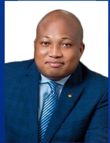
Hon. Samuel Okudzeto ABLAKWA MP, North Tongu

He holds among others a Master's Degree in Communications and Public Relations from the University of Leicester. Mr. Ablakwa is a recipient of numerous awards including Best Minority MP for 2019.