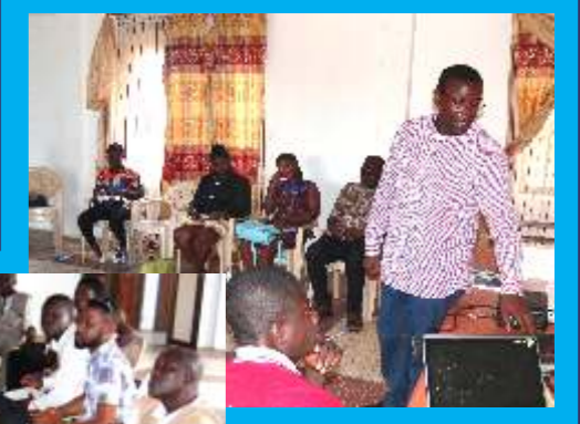
GII engages the people of Biakoye District in the Volta Region on reporting Corrupt practices