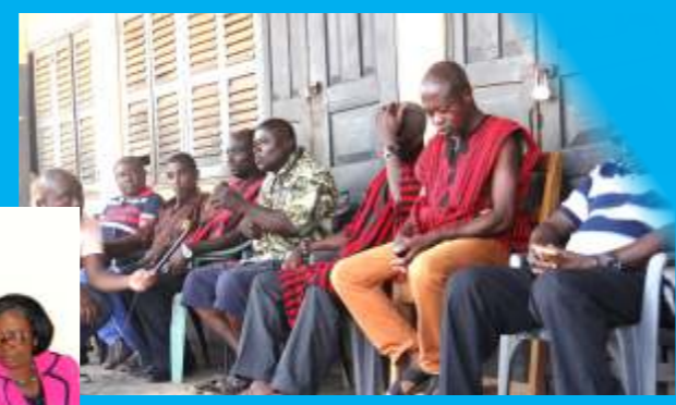
Land Forums and traditional authorities workshop