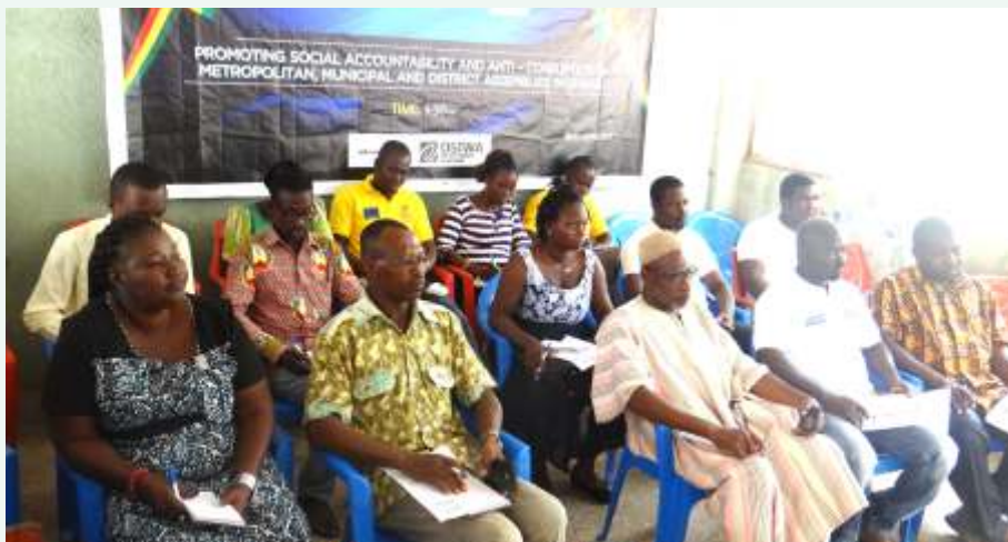
A cross section of the MMDA staff from Upper West Region

The most remarkable outcome of the training is the increased openness of the selected assemblies to the extent that various citizen's groups in the assemblies have confirmed to GII that the capacity building exercise has opened up the assemblies for more dialogues. Notable among the successes chalked during the implementation of the activity was the participation of the DCEs of the Kassena Nanka and Sissala East districts in discussion to develop a workplan for the Social Auditing Clubs (SACs).