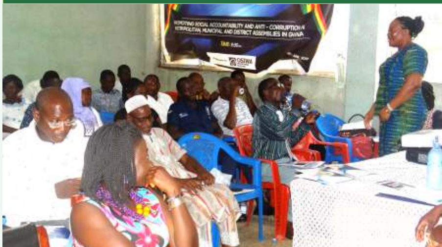
A cross section of the MMDA staff who participated in the training in the Upper West Region

As part of the Ghana Integrity Initiative's (GII) efforts to bring the fight against corruption closer to the citizens, some selected Metropolitan, Municipal and District Assemblies (MMDAs) were trained between the period of May and June, 2017 to promote social accountability using social auditing as a tool. In addition to the Social Auditing tool, the MMDAs had their capacities built on the various anti-corruption laws in Ghana.