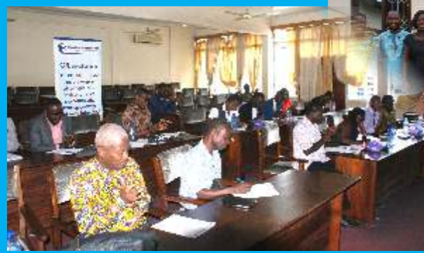
Beneficial Ownership training in the Eastern Region