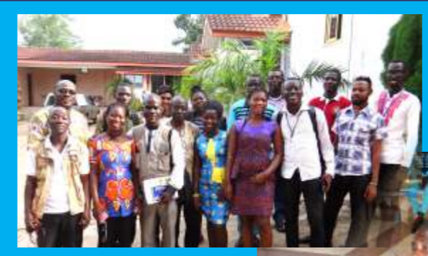
Beneficial Ownership training in the Western Region