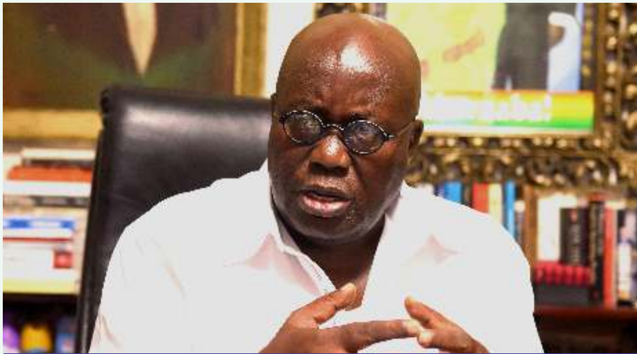
President Nana Akufu-Addo

G hana Integrity Initiative (GII), the local chapter of Transparency International, in September 2017 commended H.E. President Nana Addo Dankwa Akufo Addo for making great strides in the fight against corruption. GII's commendation followed the President's directive to the security agencies to investigate allegations of corruption made against officials within his government.