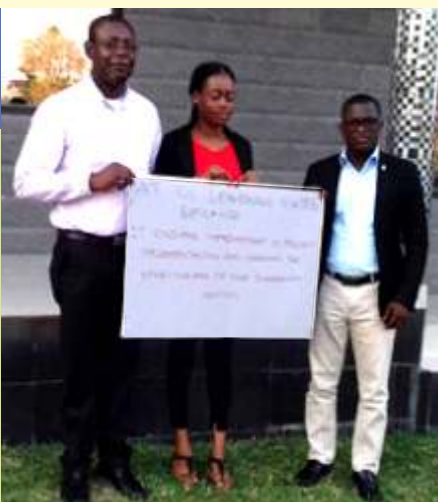
GII representatives at the SCUT mid-term review and learning meeting in Zambia

It therefore goes without saying that education is very important. We need to create awareness on the pitfalls and long term effects of corruption on the nation's wellbeing. We need to teach people that corruption is not unavoidable, that corruption is the catalyst of poverty and that corruption does affect all of us in ways that we can never imagine. I believe that if we do, corruption will be stopped and the society will be a level playing field where all and sundry will have equal chances to