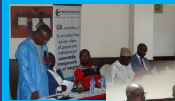
OSP Consolutions: Media, Private Sector & CSO's