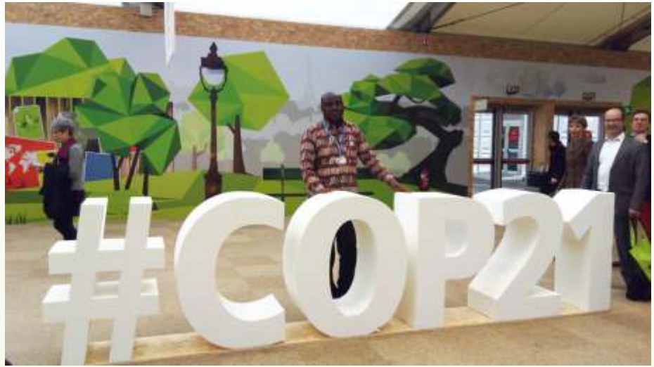
Participants at the COP 21

As delegates from 195 countries descended on Paris on 30 th November to reach an agreement on how to save the world from catastrophic climate change, on which there is near consensus among the global scientific community that it is caused by human activities, they had no confidence that the outcome would bring smiles onto people's faces. This was the 21 st yearly session of the Conference of Parties (COP) to the 1992 United Nations Framework Convention on Climate Change (UNFCCC) and the 11th session of the Meeting of the Parties to the 1997 Kyoto Protocol. The Conference of Parties (COP) is the highest body of the Convention, which is responsible for keeping international efforts to address climate change.