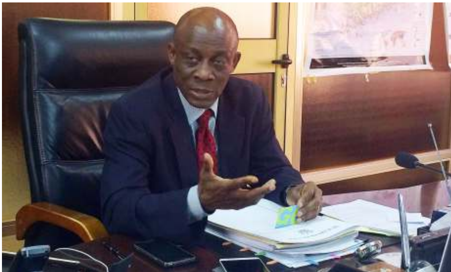
Seth Terkper- Finance Minister of Ghana

Ghana, like many other developing countries, is currently faced with the major challenge of mobilising adequate tax revenues to meet its developmental agenda. This has resulted in its continued reliance on donor support to balance the country's budget. Efforts to remedy the situation have not been successful. There are also problems in the utilisation of the