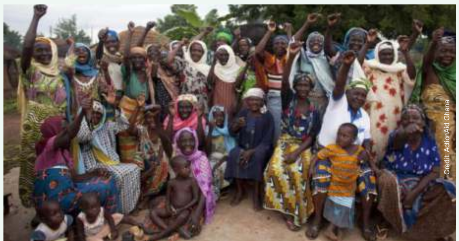
Our Land, Our Right, Our Land, Power - Women in Northern Ghana