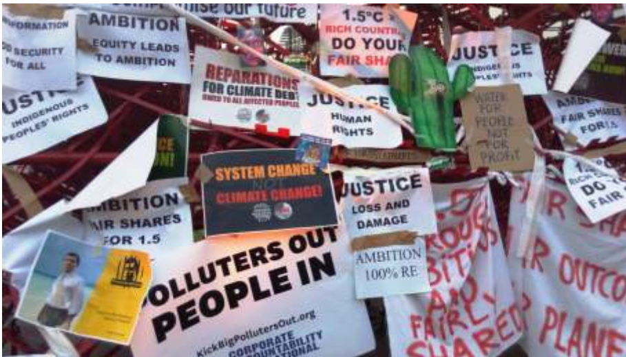
Posters on the miniature Eiffel Tower at the COP 21

situation they have not contributed to, and with limited resources to confront the problem. This demand is quite well reflected in the Paris Agreement. It specifically provides a lower reporting burden for LDCs on climate strategies, plans and actions, and mentions that the proposed transparency framework must “recognize” their situation – a caveat one hopes will not be unduly exploited.