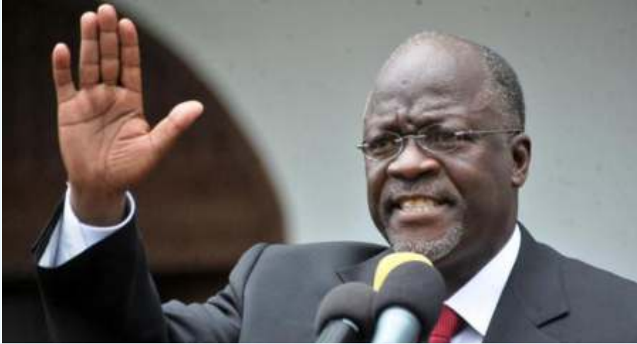
President John Magufuli, Tanzania

Since being sworn in as Tanzania's president on November 5, John Magufuli has been cracking down on corruption and wasteful spending, which are problems that continue to plague many African nations. Among Magufuli's measures is the cancelling of Tanzania's Independence Day celebration and instead using the nation's funds to battle the cholera outbreak. Rather than celebrating Tanzania's independence with an elaborate ceremony, Magufuli called on citizens to clean up around the country. Magufuli himself participated in these efforts by personally cleaning up the rubbish outside of the state house. He has banned unnecessary foreign travel for government officials. He reduced the cabinet from 30 ministers to 19.