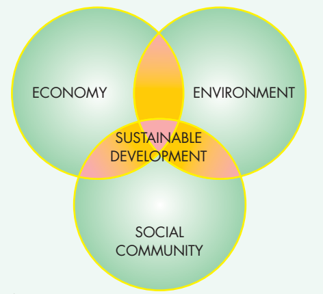
Figure 1: The Dominant Model<sup>1</sup>

The implementation of the sustainability concept has derived momentous benefits for many nations across the globe. To enumerate countries that have capitalized on sustainable development principles and made giant strides, one can quickly think of the so called Nordic Countries, Sweden, Denmark, and Norway who have invested in sustainable systems for development. Significant to note is Norway, a country that has huge fossil fuel reserves but has invested in alternative renewable sources of energy to ensure that the country's development is not based on its finite resources but on renewable and sustainable resources. Here, the "ability to last or continue for a long time" as seen in the definition comes to play. One cannot fully talk about sustainability without mentioning Denmark's giant strides especially in environmental sustainability and energy. This small Nordic country has not made its size and geographical vulnerability limit it, as it has made great strides to ensure the country's development is set on the sustainable development path.