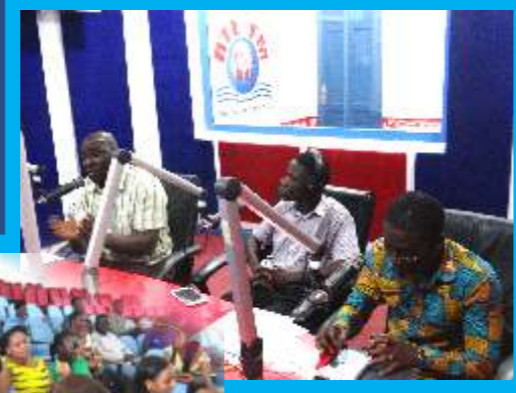
Beneficial Ownership training in the Western Region