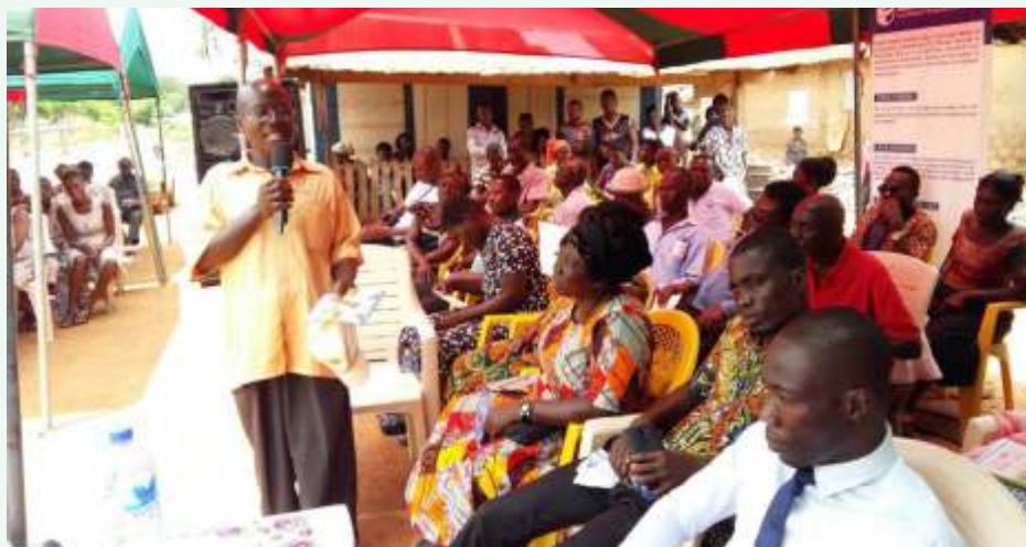
Community members of Ntumda of the Biakoye District participating in GII ALAC

The Ghana Integrity Initiative (GII) established the Advocacy and Legal Advice Center (ALAC) in 2009 to provide citizens with a mechanism to report and pursue corruption related grievances occurring in various sectors of society. Since its establishment, ALAC has offered support to many victims and witnesses of corruption. In a bid to expand the work and reach of ALAC, GII organizes community durbars in selected districts across the country every year. These durbars popularly referred to as “Mobile ALACs: bringing rights education to citizens” offer GII an opportunity to carry its services to citizens at the local level and a strategy to empower citizens to take action against corruption. The durbars also make corruption reporting more convenient for citizens and also increase corruption reporting.