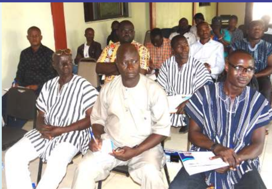
Members of the CoBMET in a meeting to engage with school management in the Upper East Region

Most public basic schools in Ghana were started through community initiatives which eventually got absorbed into the public system and management and control of these schools shifted to the Ghana Education Service. When the management and control of these community basic schools is transferred to the central government, the communities were eventually relegated to the background with very minimal involvement. As part of government's efforts to promote participation and inclusion, structures such as School Management Committees (SMCs)/Parents Teachers Associations (PTAs), District Education Oversight Committee (DEOC), District Education Planning Teams (DEPT), Circuits, Zones,