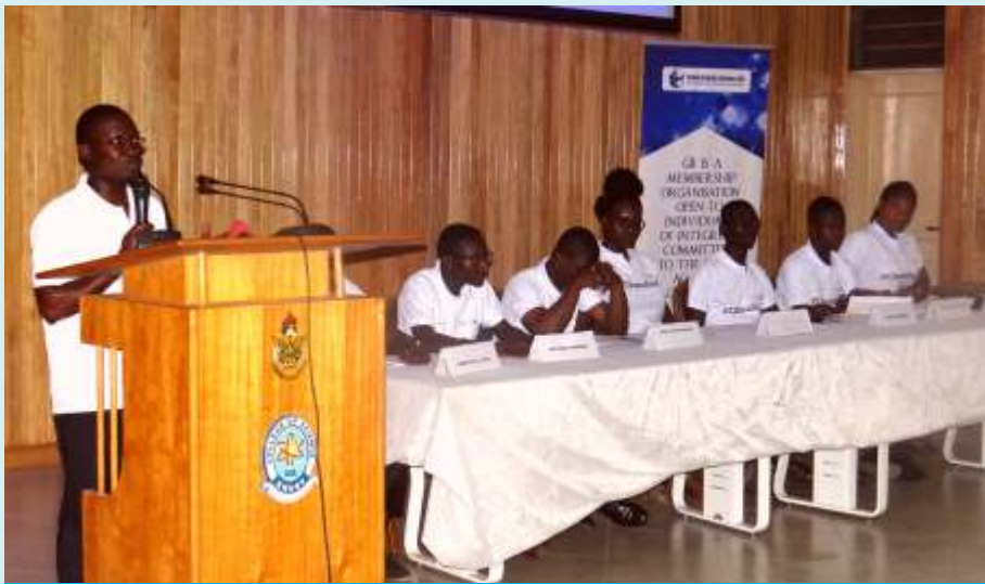
GII support Youth Parliament during the 2017 Anti-Corruption week

“If it is clear youth will be encouraged and listened to, and preparations are well thought out, you are set up for success... Having youth on boards and commissions has been a rewarding experience for everyone involved. Youth feel their voice is valued and that they have an impact on city decisions. Adult members benefit from the fresh perspective, optimism, and enthusiasm youth bring to the table.”