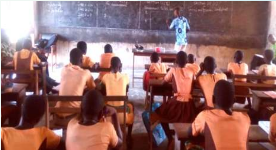
CoBMET occasionally witness teaching and leaning sections

and Primary School now render account to the parents on any monies collected with receipts of the process properly filed for future reference. Again in 2016, the Asante Akyem South CoBMET supported the administration of the Menamenaso D/A Primary, Abakabon D/A Primary and Danyameso D/A Primary to establish SMC/PTAs in their schools. The team also encouraged the community members to send their wards to school to help in the development of the community and the country