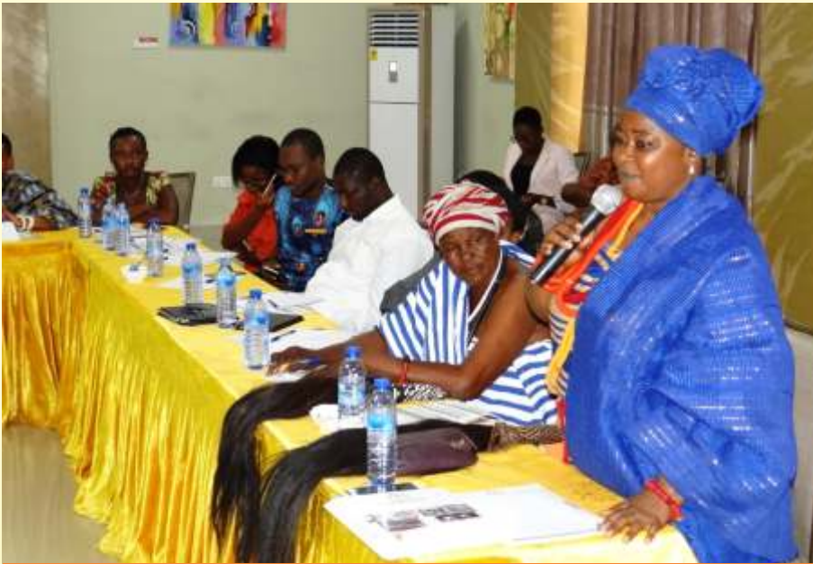
GII organized a workshop to empower Women to fight for their Land Right. In attendance are Female Traditional Rulers

Arguably, land is very much in demand. We have a lot of competing interests coming from; politicians, investors, international financiers and citizens are scrambling for a piece of it. When a lot of people compete for a limited resource like land, it becomes necessary for people to cut corners to show their power and strength. That is why we say that there is a lot of power imbalance in the land sector. Access to is governed everywhere by institutions, formal and informal, customary and statutory. By their very nature, these institutions generate both winners and losers and are thus susceptible to corruption. Individuals negotiate with these systems in order to realize their right to access land, to have this right recognized or protected or to seek redress when this right is violated. Some are successful - others are not. These obstacles include instances of explicit and implicit corruption.