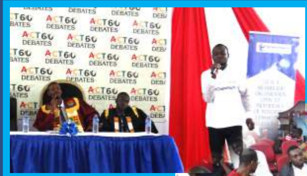
Students' Parliament in UCC at the Intra-Tertiary debate on corruption