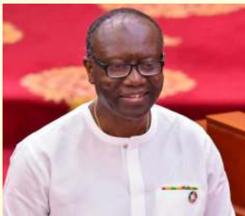
Hon. Ken Ofori-Attah Minister of Finance

The Consortium pressed home the urgency of passing the regulations and encouraged them to work closely with civil society organisations and other partners especially the advocacy platforms that they have, to achieve this as soon as possible. The MoF expressed appreciation to the GII Consortium and its partners for creating such a platform and promised to take advantage of it going forward.