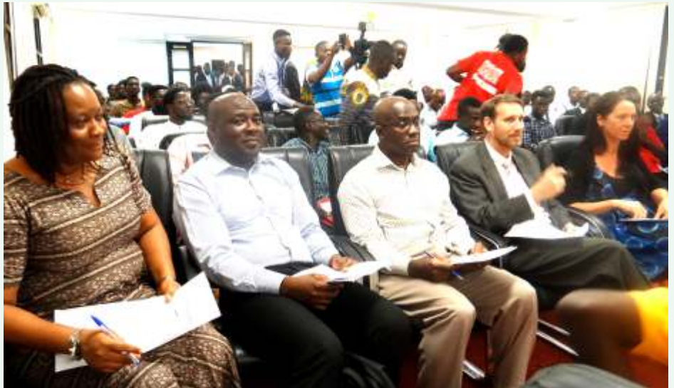
GII Programmes Team participating in the Inter Tertiary Debates

In a nutshell, the intra-debate initiative was quite an illuminating discussion drawing from the contributions of the youth towards the future. Again, it is hoped that several initiatives which will embrace the involvement and engagement of the youth will be established to create opportunities for the youth to form a part of the decision making body of the state.