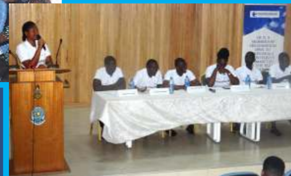
Promoting women right to land