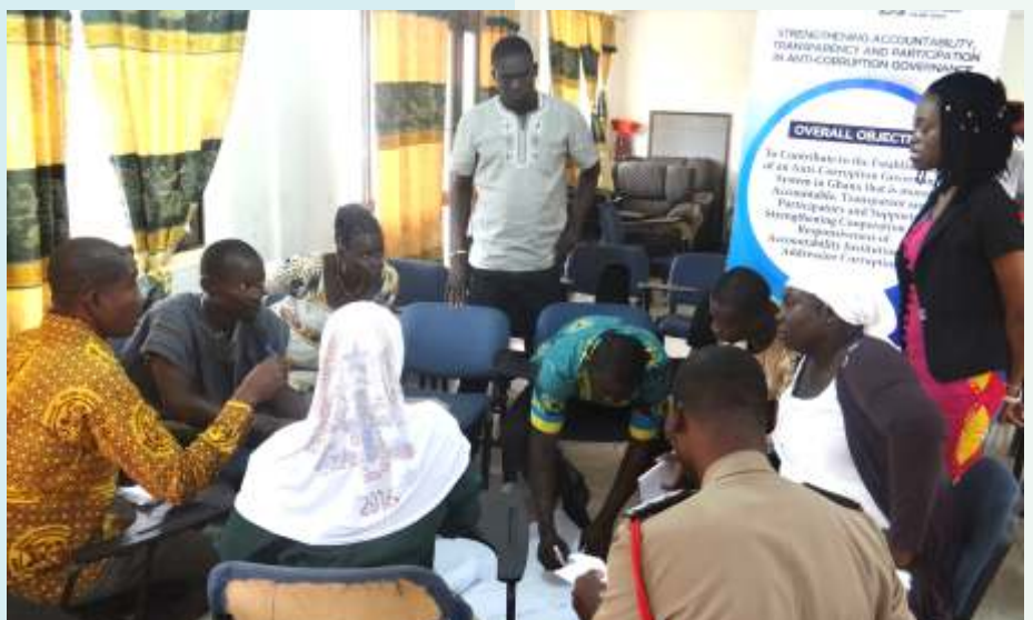
A training section for members of the CoBMET in the Eastern Region

In all, the meetings were successful as the elders and parents in the community committed to ensure quality education and also improve performance in their schools.