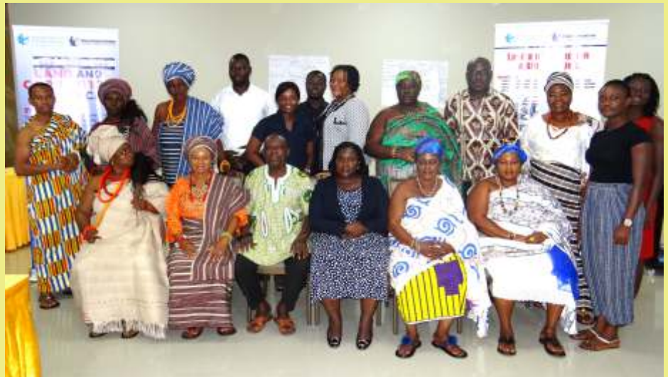
The Executive Director of GII in a pose with the Queen Mothers who participated in the Land rights workshop

especially women involved in land transactions or decisions around land and on land transaction. Free Prior Informed Consent is a strategy Ghana has adopted appropriate therefore to inform the citizens by giving prior notice to affected community, prior notice on their rights, roles and investments and also seeking their consents on the land and investment issues. Thus, if the community consents to investments on their lands, it freely gives the green light to investors to operate but this is often not