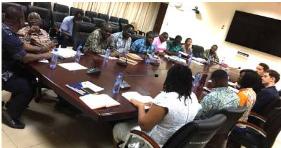
GII Consultium holding discussions on the PFM Regulation

The Ghana Integrity Initiative (GII) Consortium comprising GII, Ghana Anti-Corruption Coalition (GACC), and SEND Ghana through the Accountable and Democratic Institutions and Systems Strengthening (ADISS) seeks to fight corruption and strengthen citizen's demand for accountability. ADISS's purpose is to renew and build upon anti-corruption efforts and increase the capacities of anti-corruption Civil Society Organizations (CSOs) to motivate citizens to apply pressure on policy makers and institutions with the aim of reducing corruption in Ghana. Overall, ADISS pursues two key objectives: promote a robust and effective legal framework that prevents and sanctions corruption and improve civil society reporting, tracking and advocacy for stronger anti-corruption efforts.