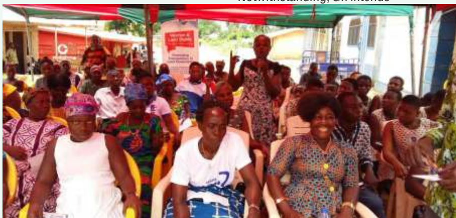
A cross section of Biakoye District citizens who participated in the ALAC public forum

Feedback from the field shows that the mobile ALACs are becoming more relevant each day. However, limited funds continue to remain a challenge to our quest to expand our mobile ALACs to many more communities. Notwithstanding, GII intends