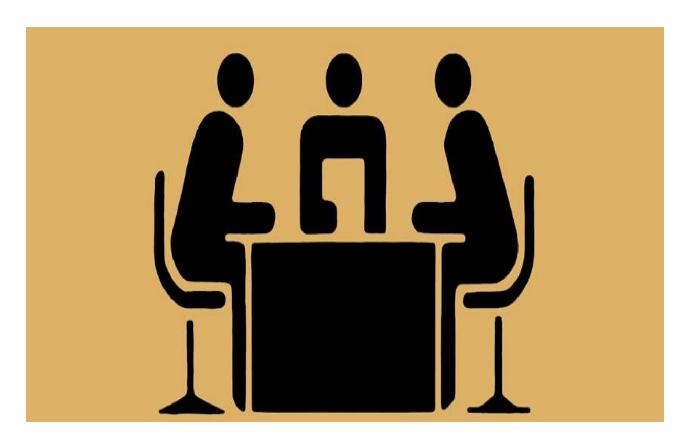
MODULE 3: ALTERNATIVE DISPUTE RESOLUTION