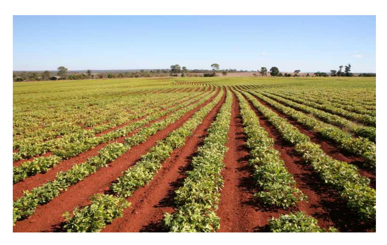
Module 6: Land Law