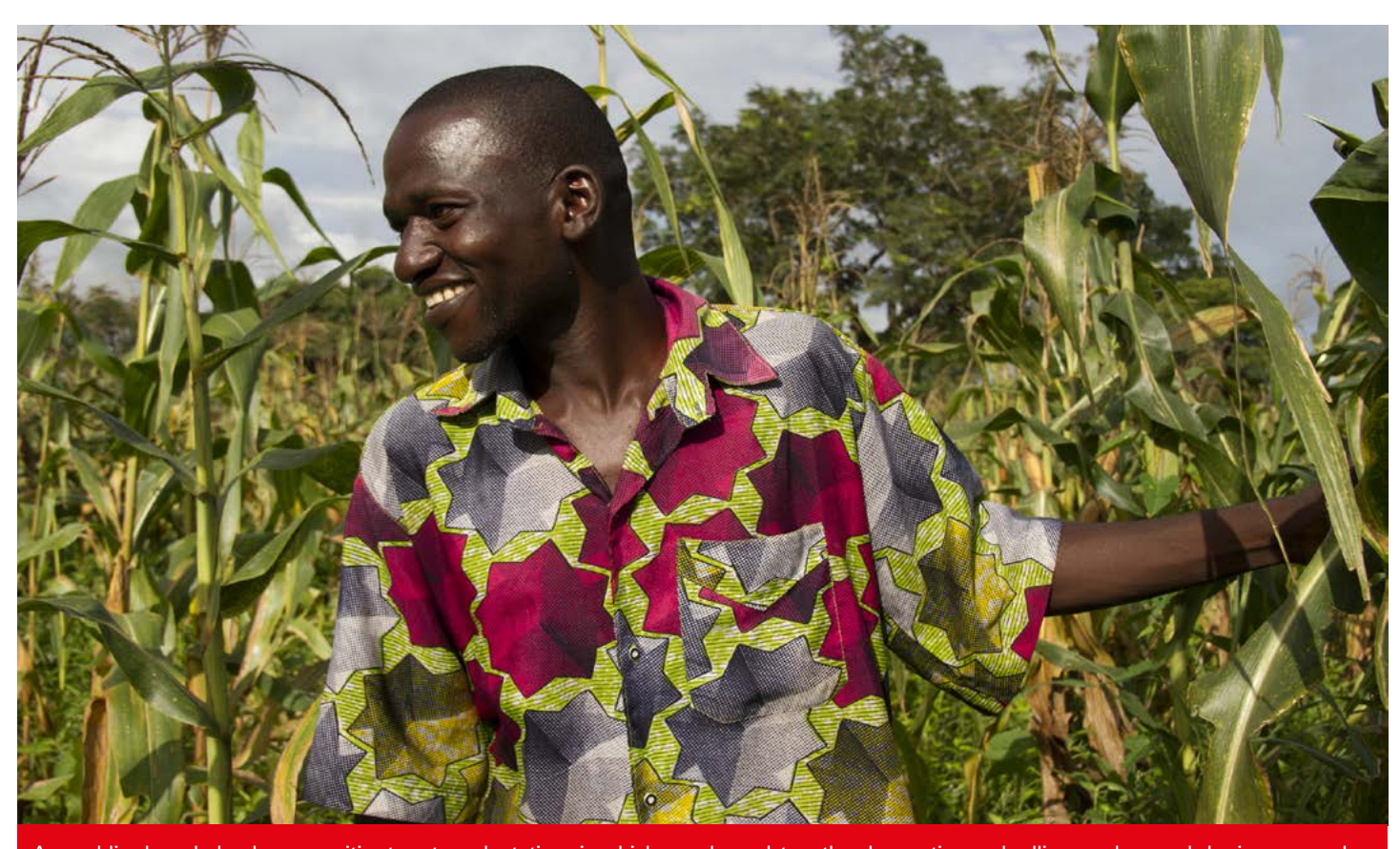
Assemblies have helped communities to set up plantations in which people work together, harvesting and selling produce and sharing proceeds.

The primary finding for LEARN is that tax education goes a long way – it is an efficient intervention. When local governments use taxes to improve public services, interaction with the citizenry is improved.