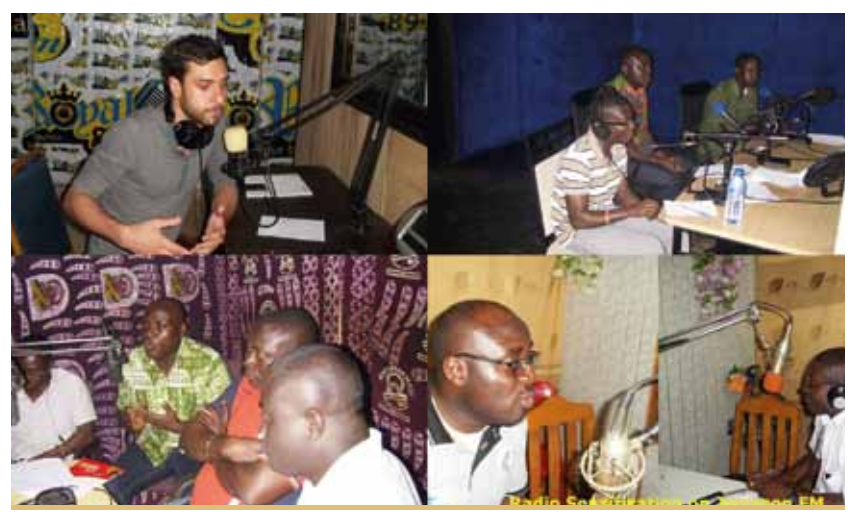
Field Visit by Transparency International REDD+ Coordinator