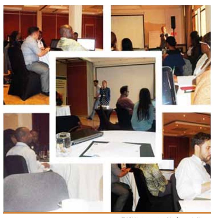
TI REDD+ International Conference in Kenya