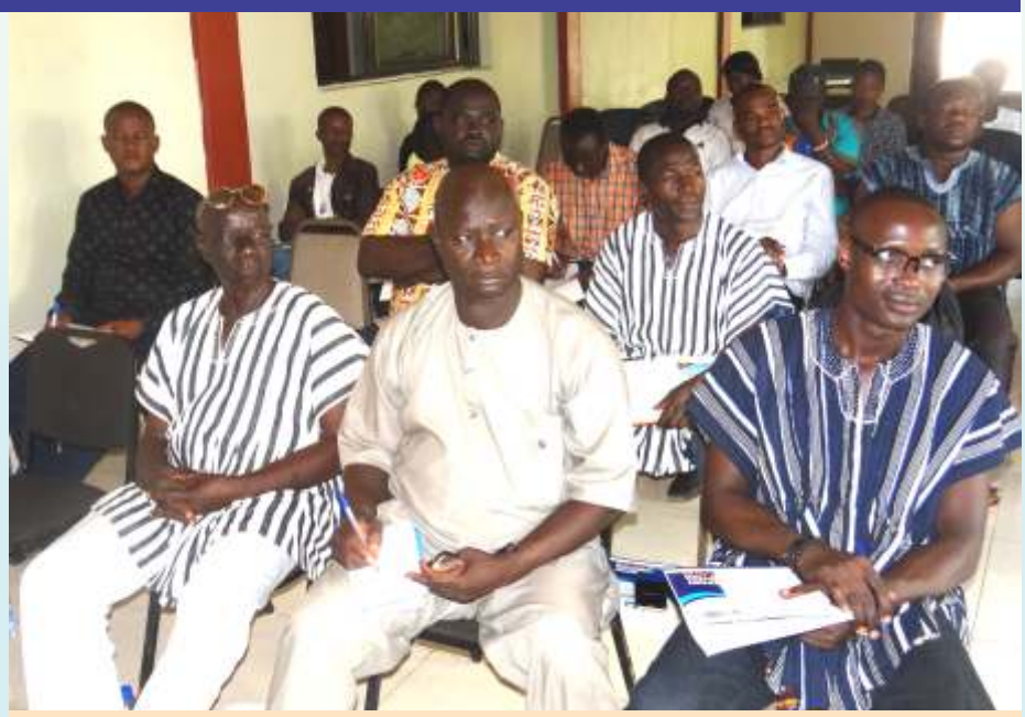
Members of the CoBMET in a meeting to engage with school management in the Upper East Region

ost public basic schools in Ghana were started through community initiatives which eventually got absorbed into the public system and management and control of these schools shifted to the Ghana Education Service . When the management and control of these community basic schools is transferred to the central government, the communities were eventually relegated to the background with very minimal involvement. As part of government's efforts to promote participation and inclusion, structures such as School Management Committees (SMCs)/Parents Teachers Associations (PTAs), District Education Oversight Committee (DEOC), District Education Planning Teams (DEPT), Circuits, Zones,