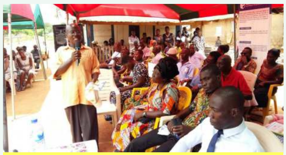
Community members of Ntumda of the Biakoye District participating in GII ALAC

he Ghana Integrity Initiative (GII) established the Advocacy and Legal Advice Center (ALAC) in 2009 to provide citizens with a mechanism to report and pursue corruption related grievances occurring in various sectors of society. Since its establishment, ALAC has offered support to many victims and witnesses of corruption. In a bid to expand the work and reach of ALAC, GII organizes community durbars in selected districts across the country every year. These durbars popularly referred to as "Mobile ALACs: bringing rights education to citizens" offer GII an opportunity to carry its services to citizens at the local level and a strategy to empower citizens to take action against corruption. The durbars also make corruption reporting more convenient for citizens and also increase corruption reporting.