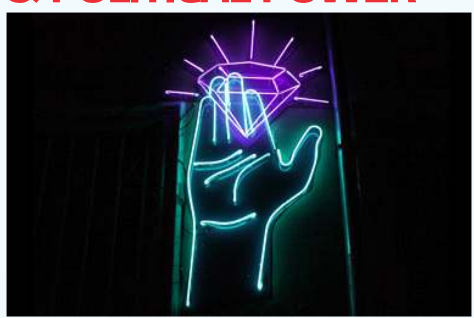
Written by Louise Russell-Prywata on Friday, 13 April 2018

he recent headline that the <u>richest</u> 1% are on target to own two thirds of all wealth by 2030 has caused quite a stir. It's clear that the public are concerned about the consequences, and many believe it will lead to increased corruption.