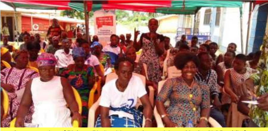
A cross section of Biakoye Distict citizens who participated in the ALAC public forum

Feedback from the field shows that the mobile ALACs are becoming more relevant each day. However, limited funds continue to remain a challenge to our quest to expand our mobile ALACs to many more communities. Notwithstanding, GII intends