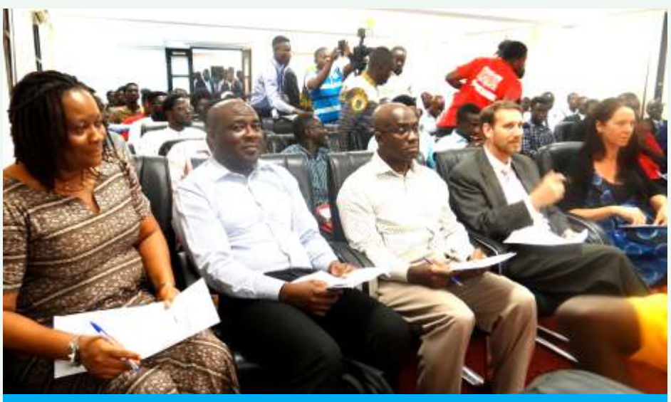
GII Programmes Team participating in the Inter Tertiary Debates

In a nutshell, the intra-debate initiative was quite an illuminating discussion drawing from the contributions of the youth towards the future. Again, it is hoped that several initiatives which will embrace the involvement and engagement of the youth will be established to create opportunities for the youth to form a part of the decision making body of the state.